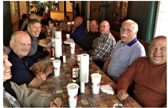
100 th Division Retiree Luncheon @ WW Cousins 30 Oct 2019 (11:30)