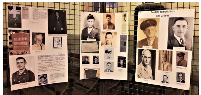
Photos from the French Ceremony honoring the 100 th Infantry Division on Nov 16, 2019