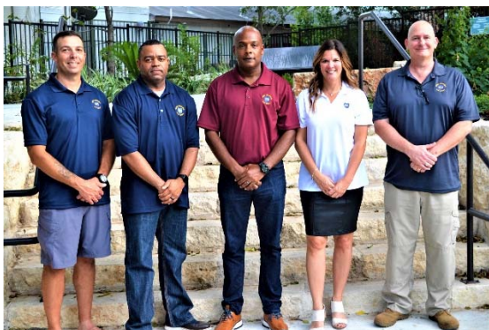
Attendees from left to right: