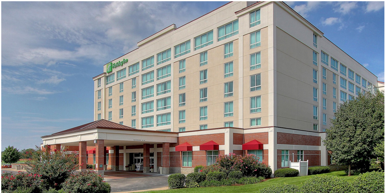
Holiday Inn University Plaza-Bowling Green