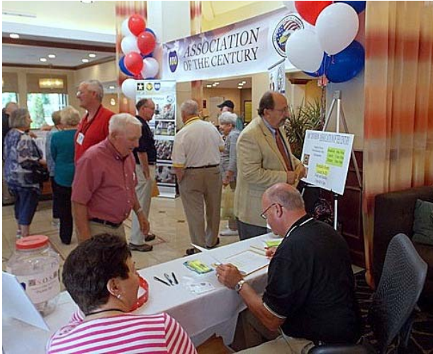
Registration desk in the lobby of the Hilton with the AOC's sign prominently displayed.