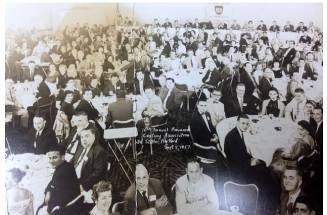
The 10 th Annual Reunion of the Century Division Association was on 8 Sept 1957 in Hartford, Conn.