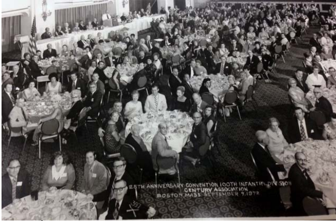
The 25 th Annual Reunion of the Century Division Association was on 9 Sept 1972 in Boston, Mass.