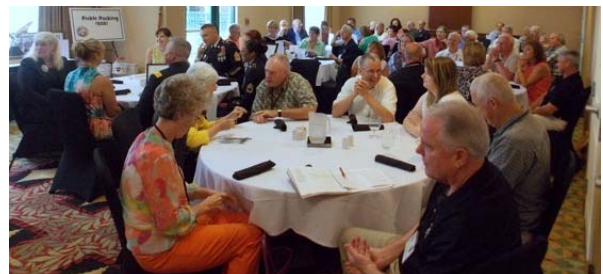
Everyone is ready for Saturday lunch to be served!