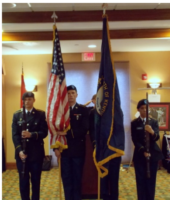
The Color Guard from Western Kentucky University ROTC presenting the Colors at Saturday night's dinner