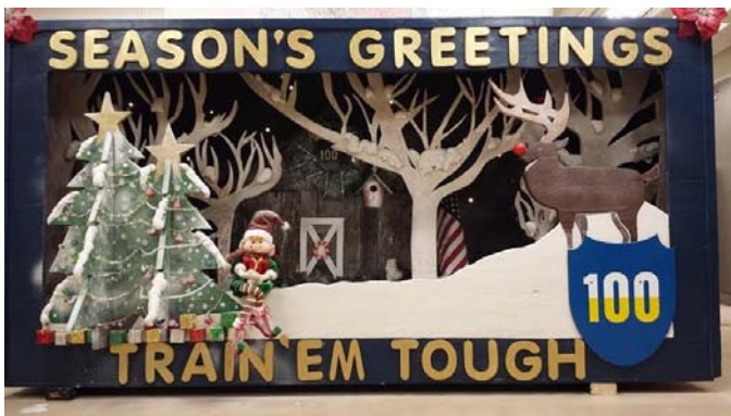
100 th Division's 2013 entry in the Fort Knox "Christmas Card" Contest. 1 st Place Winner