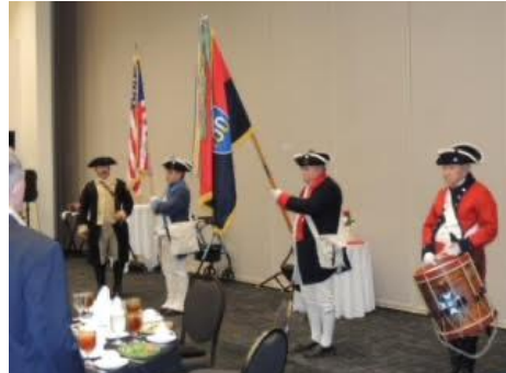
Posting the Colors by the Sons of The American Revolution