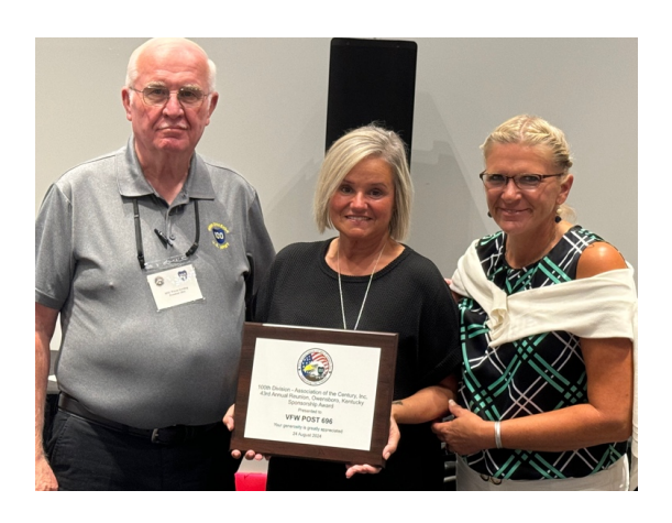
Veterans of Foreign Wars Post 696, Owensboro