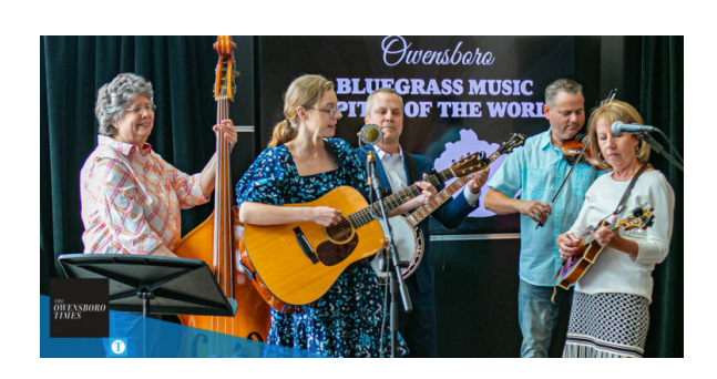
The Owensboro Bluegrass Band from the Bluegrass Hall of Fame and Museum delivered a fantastic performance Saturday night! They had everyone on their feet dancing and clapping.