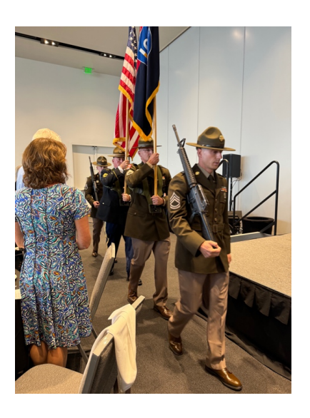
Drill Sergeants from 1-398 BCT, 104<sup>th</sup> Training Division (LT), 108<sup>th</sup> Training Command, Owensboro, KY, smartly posted The Colors at Saturday night's banquet. All were wearing current Class A Army Uniforms.