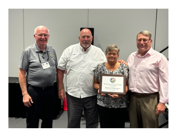
American Legion Post 9, Owensboro