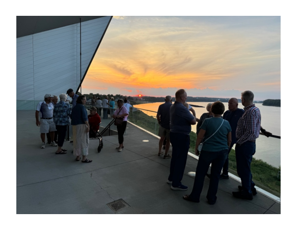
Friday night from the deck of the Owensboro Convention Center as attendees enjoy the sunset and perfect weather.