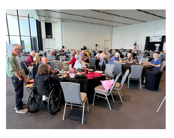
Folks played bingo for prizes on Saturday afternoon in a fundraiser for AOC Scholarships.