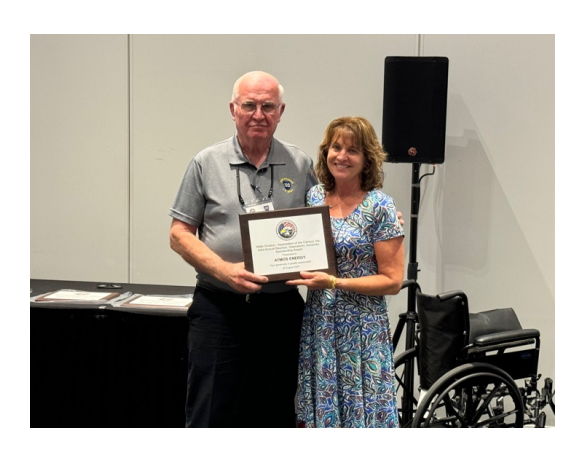
Atmos Energy, Western Kentucky Area

We could not have enjoyed this wonderful weekend of activities and entertainment without the generous financial support of the following organizations shown in the photos below. We hope you will support each of them: